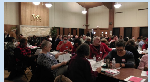
Envisioning Our Senior Centers