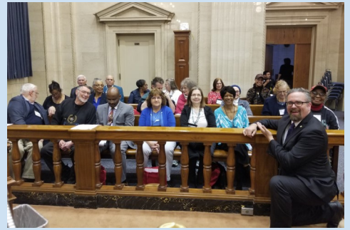
Senior Statesman Program