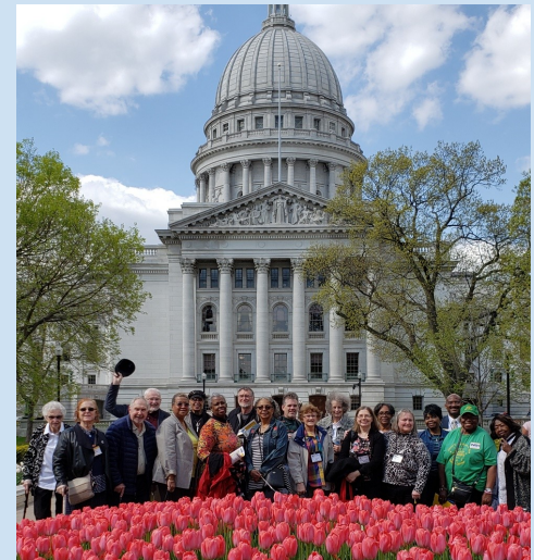
Aging Advocacy Day in Madison