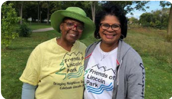
THE FRIENDS OF LINCOLN PARK

In 2010 several community partners worked to develop the Milwaukee River Greenway Master Plan, a vision for connecting recreational spaces along the Milwaukee River. One component of the plan included closing a gap between Lincoln and Estabrook parks so that the two Parks would be accessible by a connecting trail. These two Friends Groups – with many community partners and volunteers! – worked tirelessly to dig the trail by hand through forest and prairie, meandering beneath highway infrastructure and along the shore of the Milwaukee River. The trail is open today and maintained by Friends Groups, community volunteers, and local organizations. The effort highlights the importance of Friends Groups in building and connecting communities in Milwaukee County, and is a perfect example of Friends Groups as the “hands” of our great Parks.