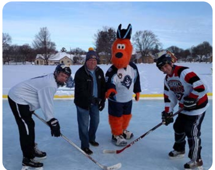
THE FRIENDS OF CENTER STREET PARK

In 1994 the community around Lake Park celebrate the Park’s centennial honoring the history of the Frederick Law Olmsted-designed Park. The celebration prompted the community to gather around the idea of starting a “friends of the park” group, and in 1996 Lake Park Friends was incorporated. The group has led many impressive efforts since they started, included fundraising for bridge restorations, maintaining natural areas, hosting summer-long concert series, providing regular cleaning and polishing of the Park’s monuments and statues, and volunteering to help maintain Park infrastructure such as sheds and trails. Their signature event, Cirque du Lake Park, raise thousands of dollars each year to support historical preservation projects throughout Lake Park.