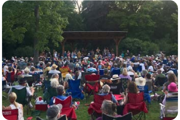
THE FRIENDS OF LAKE PARK

When several neighbors noticed that the Park across the street from their homes was largely unused, they decided to do something about it. Friends of Center Street Park is a group comprised mostly of parents from the surrounding neighborhood working to activate and improve Center Street Park. Each winter, the Friends Group secures sponsorship from local businesses to run a very popular outdoor skating rink used for hockey and open skating. The group shows that with a little dedication from the community, our Parks can be filled with activity year-round. A core group of volunteers work to set-up the ice rink each year in addition to hosting regular events and raising funds for projects at the Park. The group jokes – and it’s probably true! – that Center Street Park is busier in winter than in summer, and in Milwaukee, that is quite the feat!