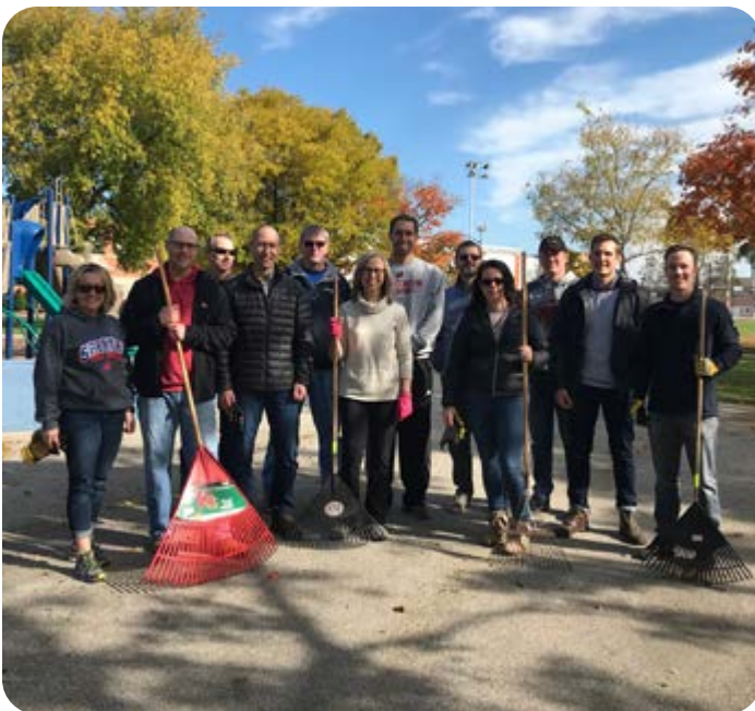
THE FRIENDS OF ???