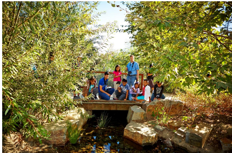
NATURE GARDENS AT NHMLA - Los Angeles, CA