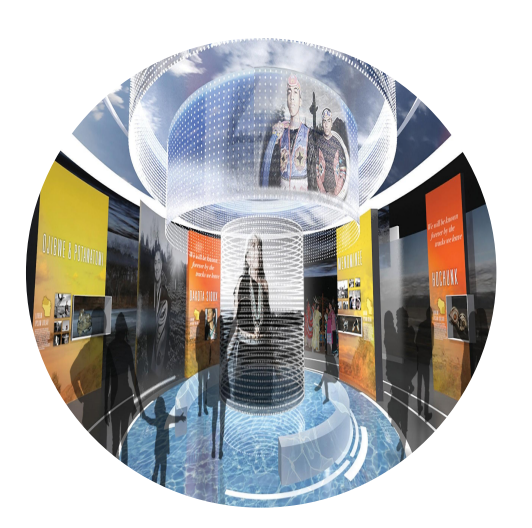
Who We Are & How We Got Here