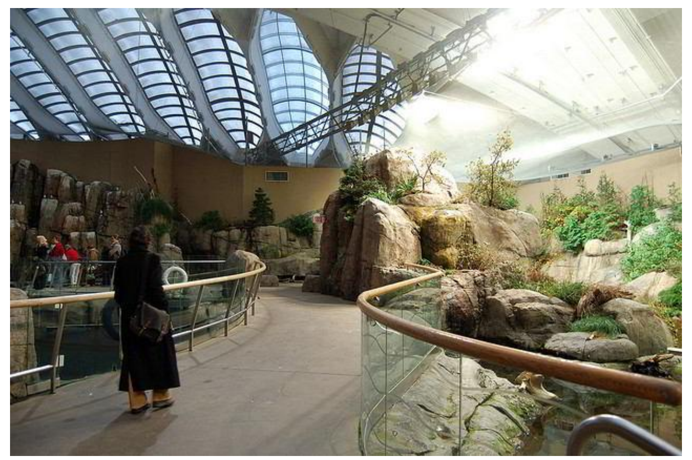
Montreal Biodome - Montreal Canada