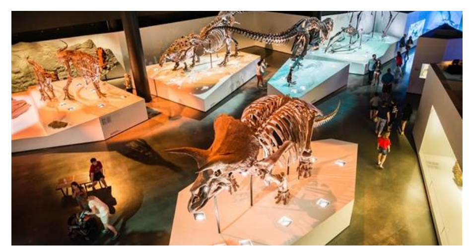
HOUSTON MUSEUM OF NATURAL SCIENCE - Houston, TX

Creating a blended experience that marries the immersion into the natural world currently at Mitchell Park and the journey of the human experience at Milwaukee Public Museum is a model that can be self-sustaining, advance the mission of both institutions, and serve and inspire the people of Wisconsin.