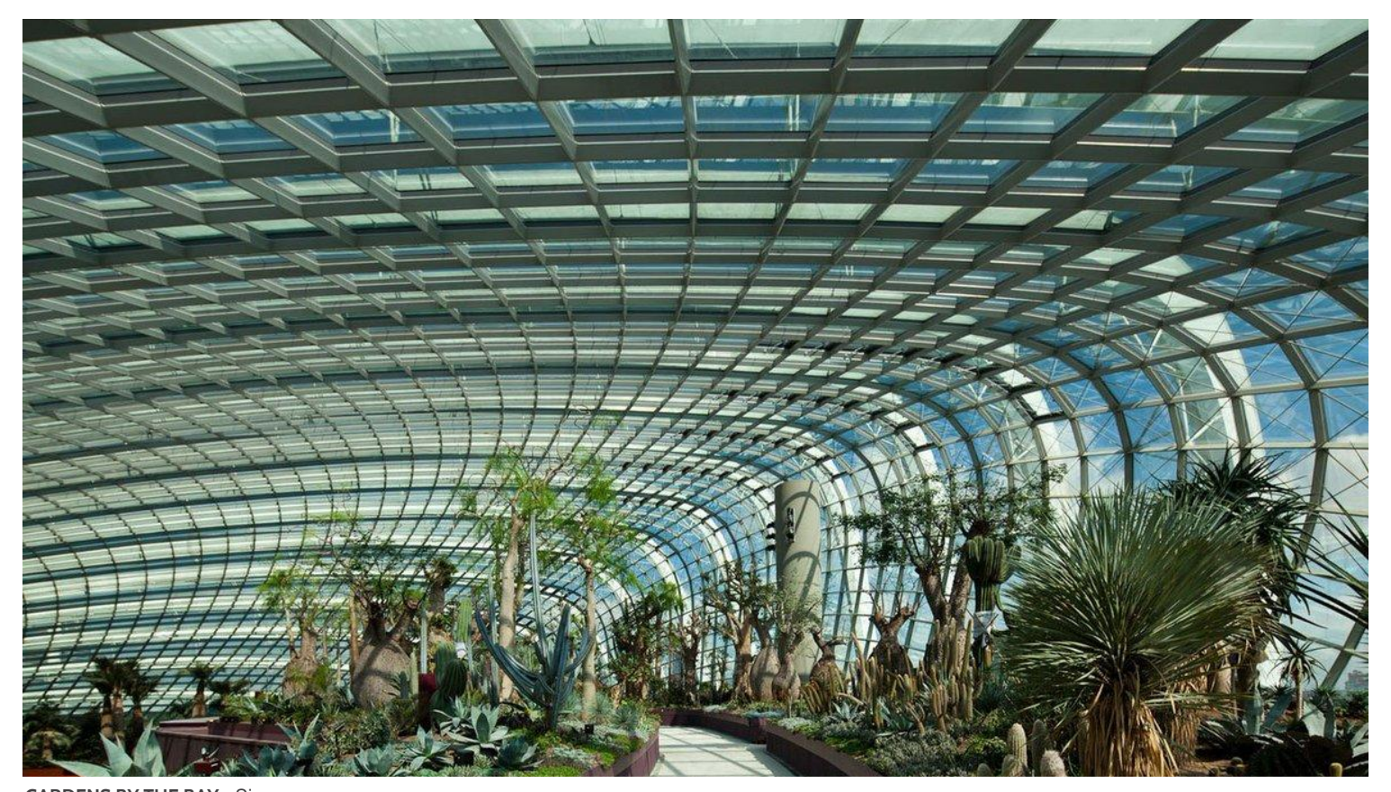
GARDENS BY THE BAY - Singapore