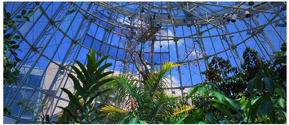
OCKRELL BUTTERFLY CENTER AT THE HOUSTON MUSEUM OF NATURAL SCIENCE - Houston, TX