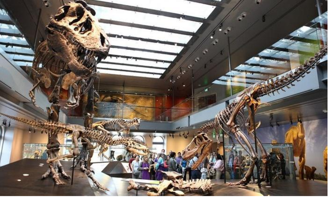
NATURAL HISTORY MUSEUM OF LOS ANGELES - Los Angeles, CA

Working with our content and design teams, we have identified museums that have successfully paired the experience of a natural history museum and the immersion of a conservatory or botanical garden.