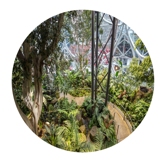
Immersion In The Natural World