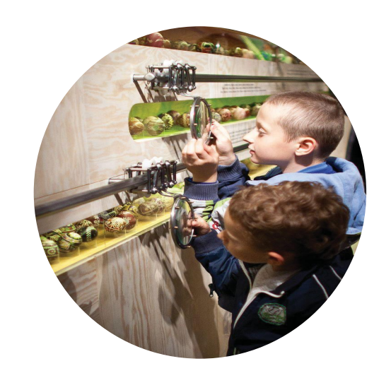
The Human Experience