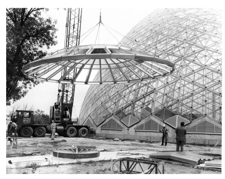
In 2014, the County's greenhouses were relocated from western Milwaukee County to just east of the Facility, and functionally connected. This added 61,000 square feet of facilities, including a 10,000 sq. ft. greenhouse-like conservatory annex that can function as a special event space. The greenhouses serve the horticultural needs of the Conservatory, Boerner Botanical Gardens, and various satellite park sites.