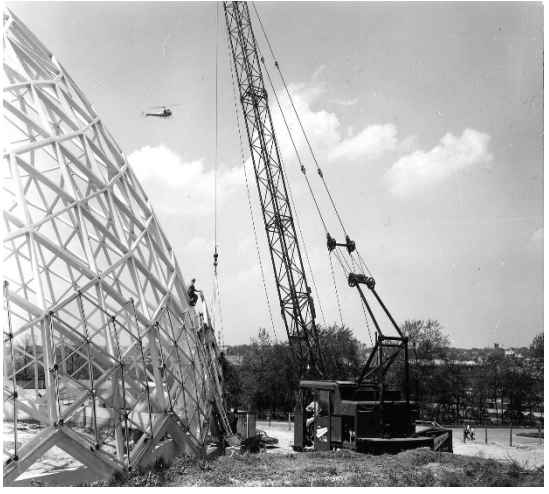
Page 3 of 10 - RFP