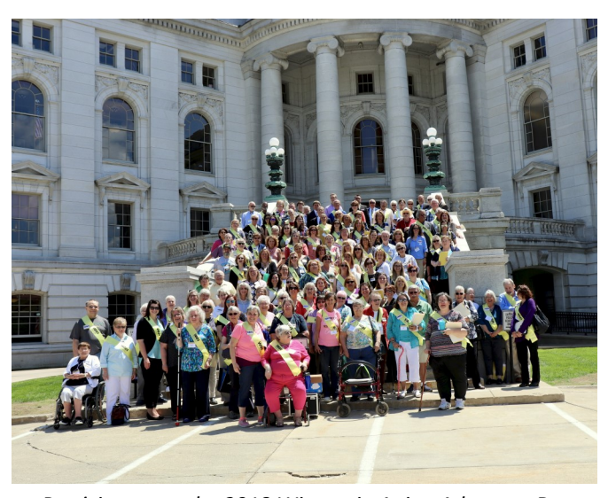
Participants at the 2018 Wisconsin Aging Advocacy Day.

Opportunities abound to advocate and advise policy-makers on issues of importance to seniors.