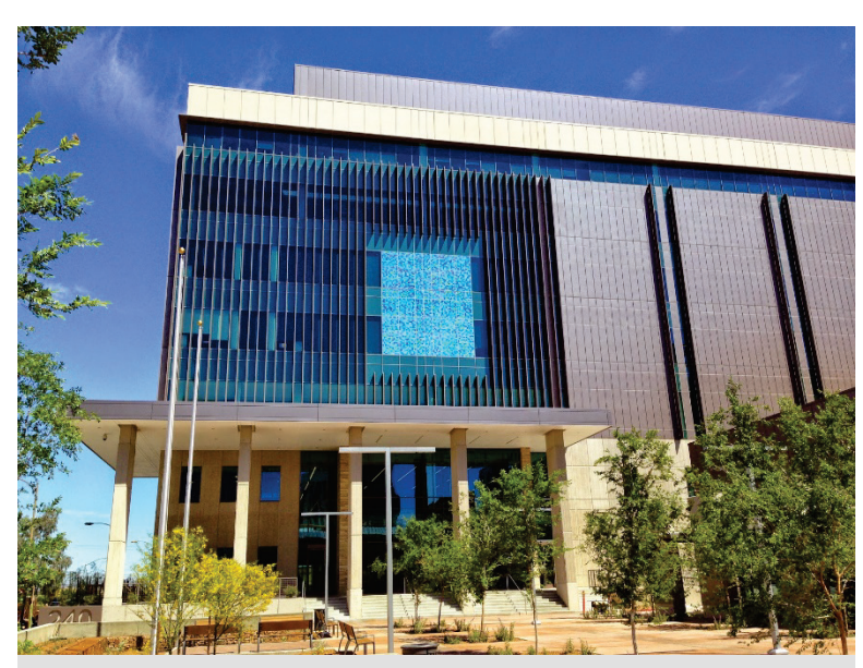
Pima County, Arizona

In 2004, Pima County voters approved $76 million in 30-year G.O. bonds to fund the complex. The new courthouse originally was intended to house both County and City of Tucson municipal court functions. However, the County was forced to come up with an extra $67 million – which it accommodated through its