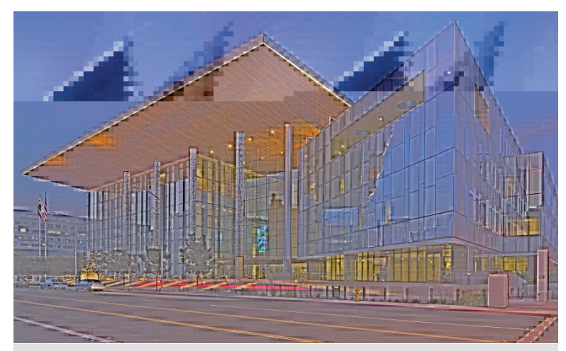
Los Angeles County, California

In 2007, the Legislature approved a proposal for consideration of a P3 for a new Los Angeles County courthouse. The project was contingent upon the Legislature's review and the Department of Finance's review and approval of key project elements, such as cost and performance standards.