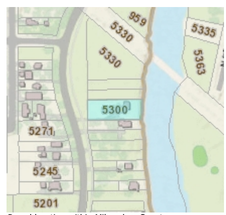
Parcel location within Milwaukee County