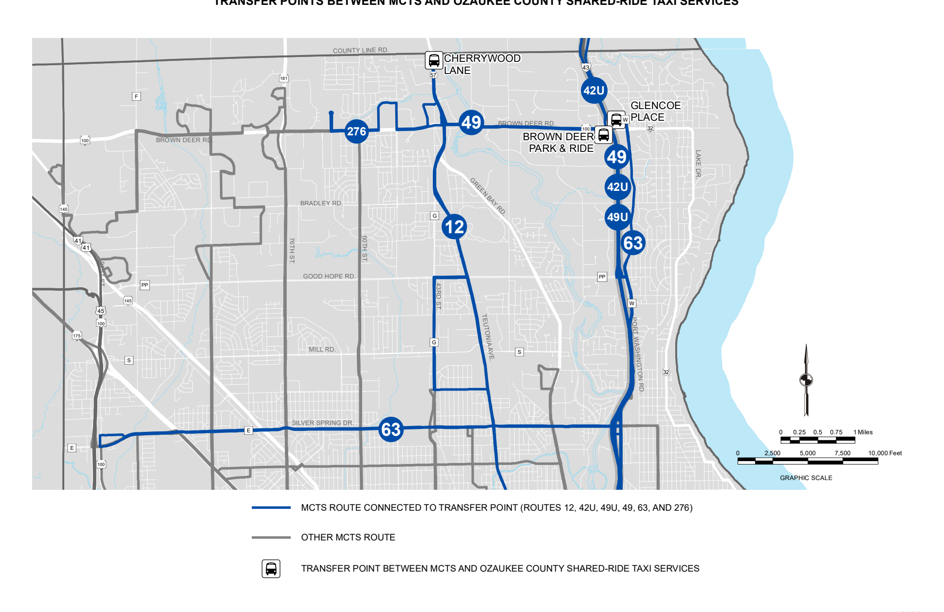
-2Map 1 TRANSFER POINTS BETWEEN MCTS AND OZAUKEE COUNTY SHARED-RIDE TAXI SERVICES