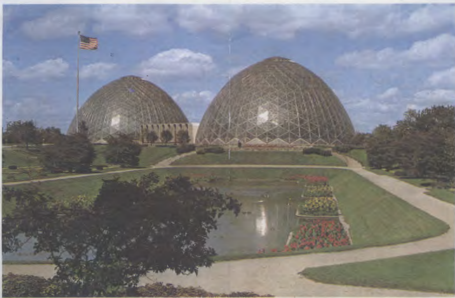
Mitchell Park Horticultural Conservatory

it be a weekend, a week, or a month. There's a friendly, happy atmosphere in Milwaukee County which you'll like and from which you'll never want to depart.