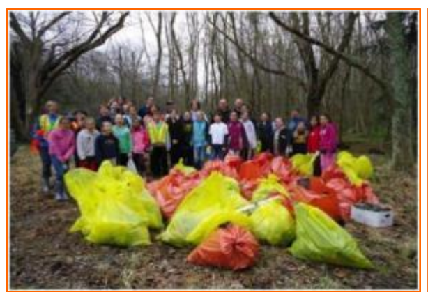
Go Ape Organized Park Cleanup Day