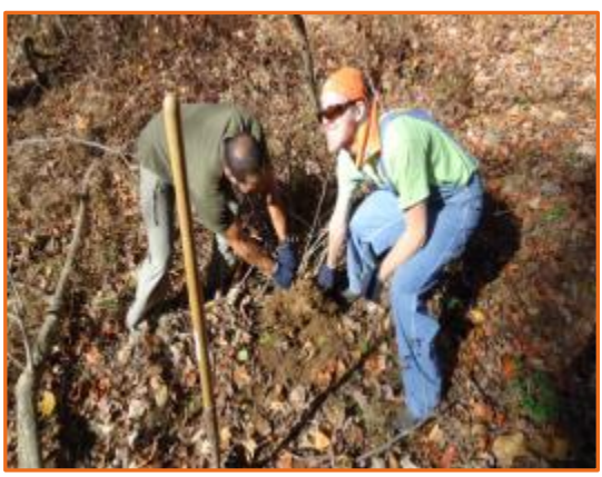
Go Ape Non-Native Removal