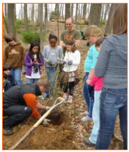
Go Ape Non-Native Invasive Removal and Native Planting with Girl Scouts