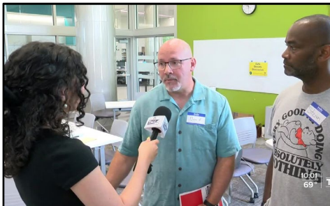
TMJ4 News Coverage of Safe Streets Roadshow at Good Hope Branch of Milwaukee Public Library

Safe Streets Roadshow roll-up banner for tabling events