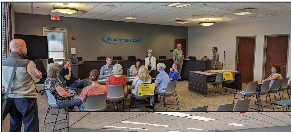
Safe Streets Roadshow in Bayside