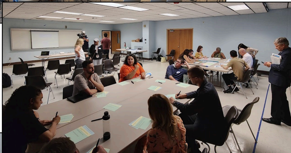
Safe Streets Roadshow at Kosciuszko Community Center in Milwaukee