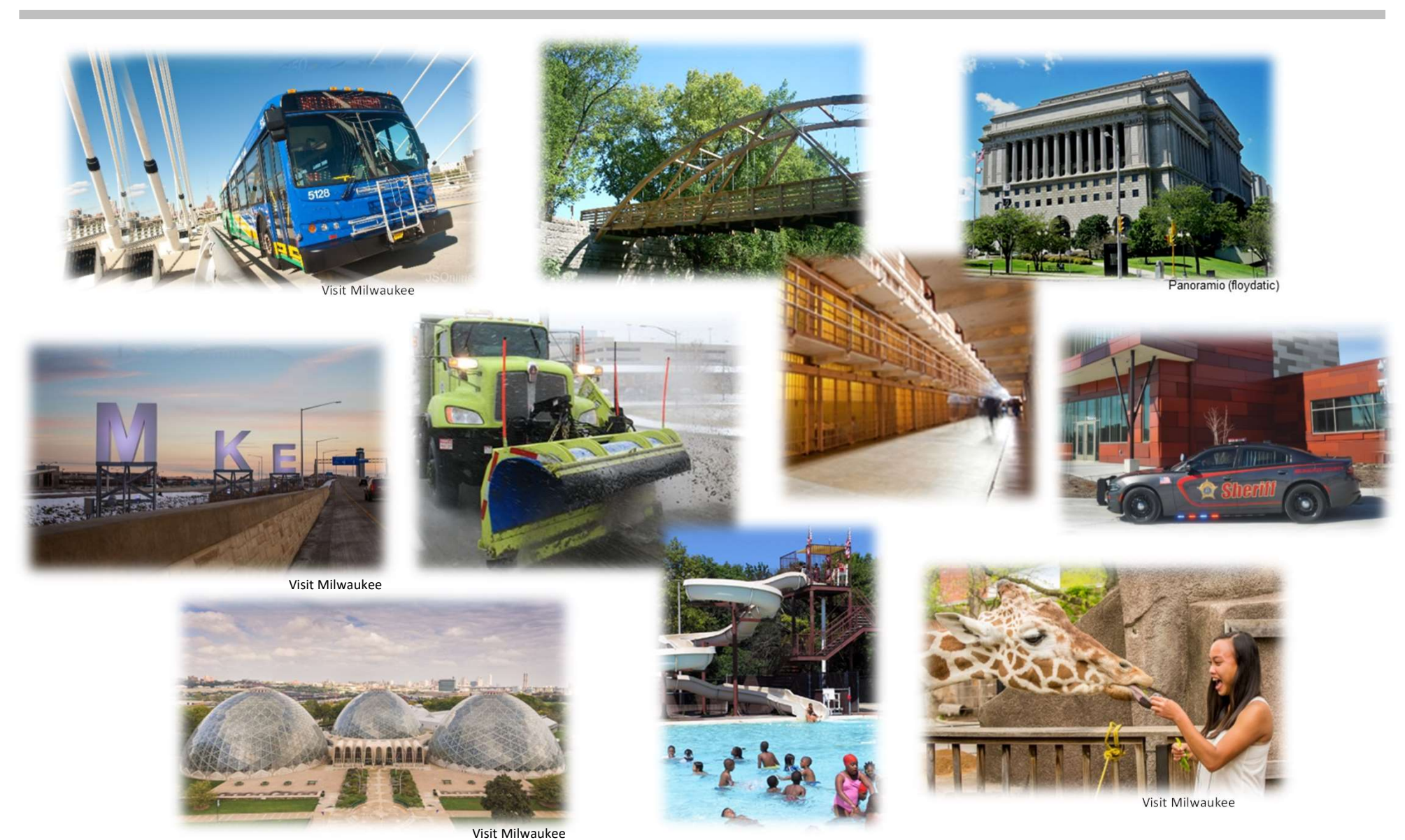
Climate Action 2050 Plan Overview