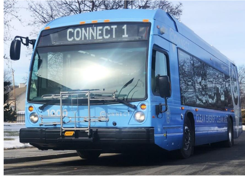
Fast, Frequent, Reliable