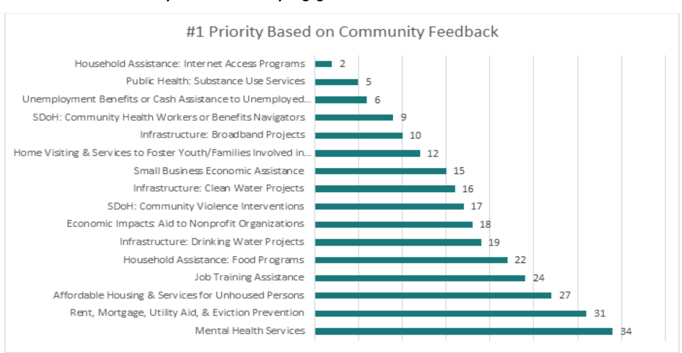
Table C: Milwaukee County ARPA Community Engagement Feedback

subgroup is preparing to release an Evaluation Request for Proposals (RFP) to meet U.S. Department of the Treasury evaluation requirements with the $4,000,000. The Fund Administration group will request $2,087,500 of the $7,347,848 to build a sustainable model for equitable community engagement that centers community health and resilience, and that builds leadership, organizational, and advocacy capacity of County residents and vulnerable communities to be full and equal partners in determining and implementing strategies for COVID response and recovery. The following table demonstrates the community priorities submitted through the Milwaukee County public webpage.