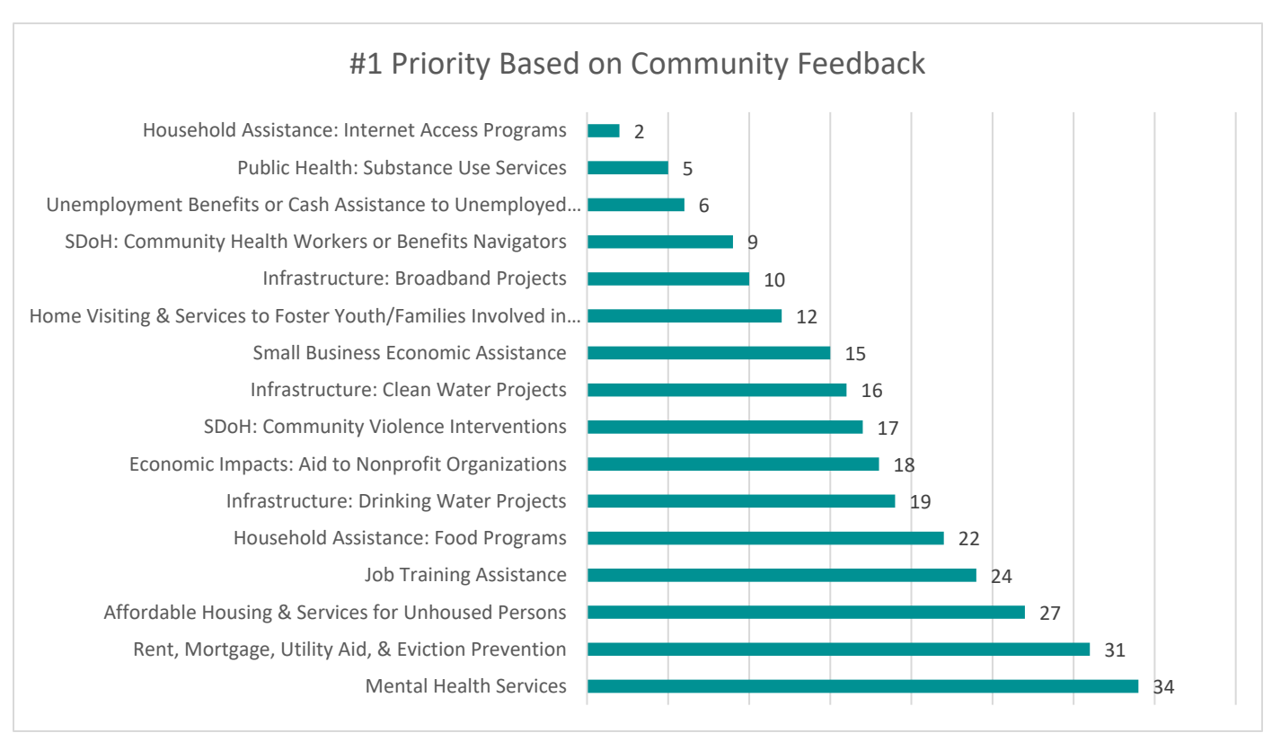
Table C: Milwaukee County ARPA Community Engagement Feedback

The following table demonstratives the community priorities submitted through the Milwaukee County public webpage.