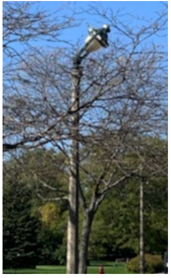
Significant lighting repairs needed throughout Milwaukee County Parks