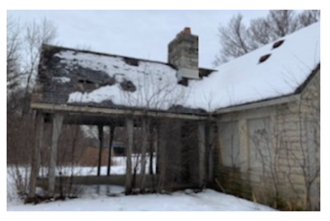
Milwaukee County Parks are home to a number of dilapidated pavilions that cannot be used

Two priority areas identified by Milwaukee County Parks leadership and resident input, were: Building Improvements and Safety . Milwaukee Parks Foundation has chosen these priorities as the first focus of our grantmaking and fundraising. Examples of projects within the focus areas of Safety and Building Improvements include: improved park lighting, park ranger equipment and uniforms, park pathway repair, pavilion repairs, sustainability and climate resiliency for park facilities (i.e. Solar, LED, stormwater management), facility planning, specific community centers, etc.