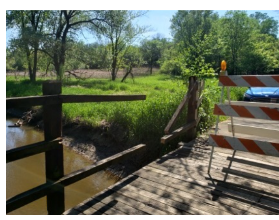
Pathway improvements such as bridge repair are critical for resident safety