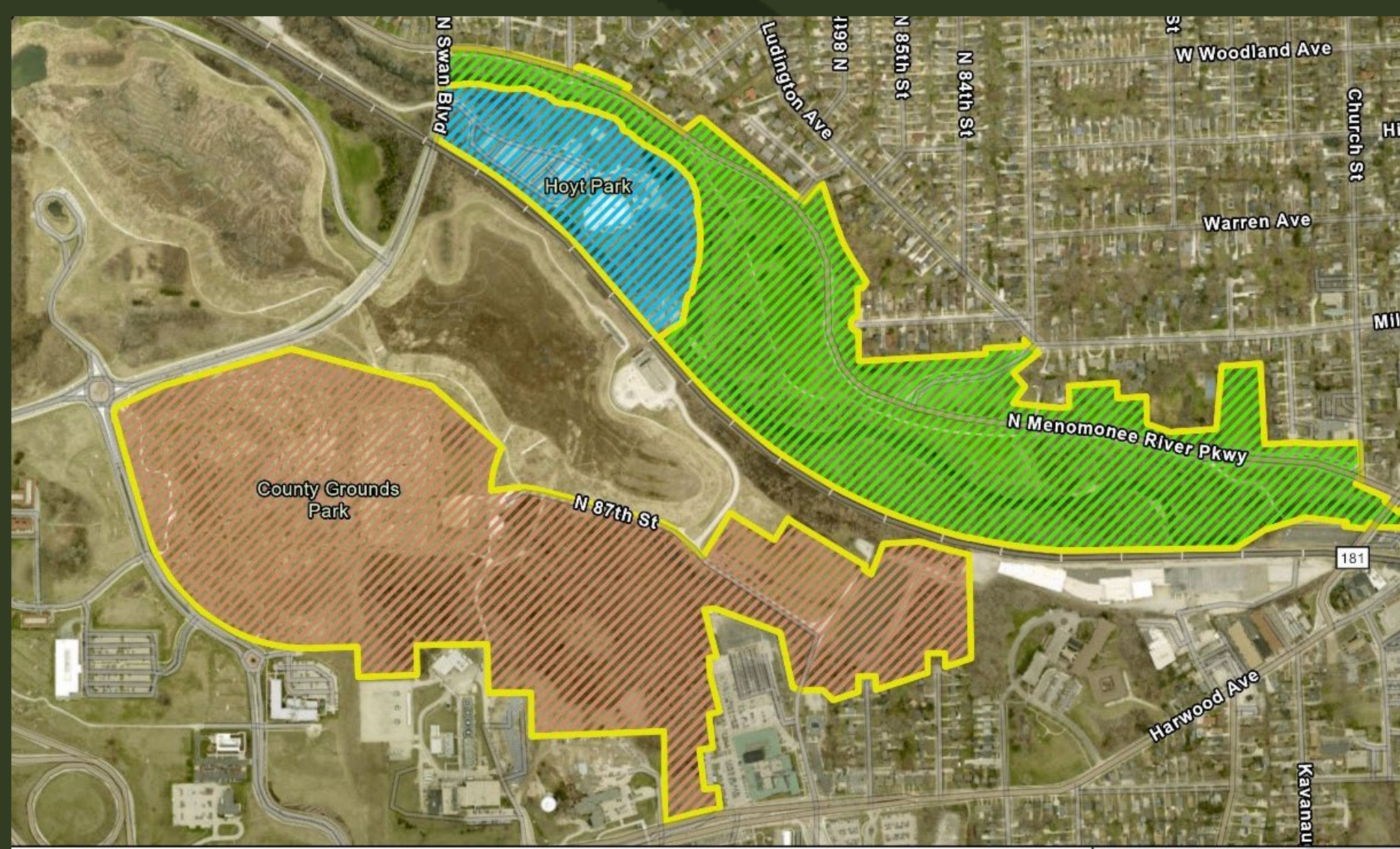
County Grounds, Hoyt, Menomonee River Parkway Section 9

Improve habitat to support healthy populations of fish and wildlife.