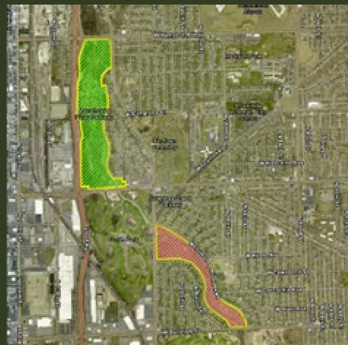
Menomonee River Parkway (Section 5 & 6)