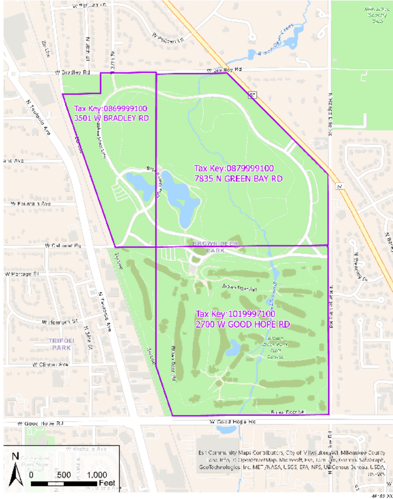
EXHIBIT B LOCATION OF PROPERTY