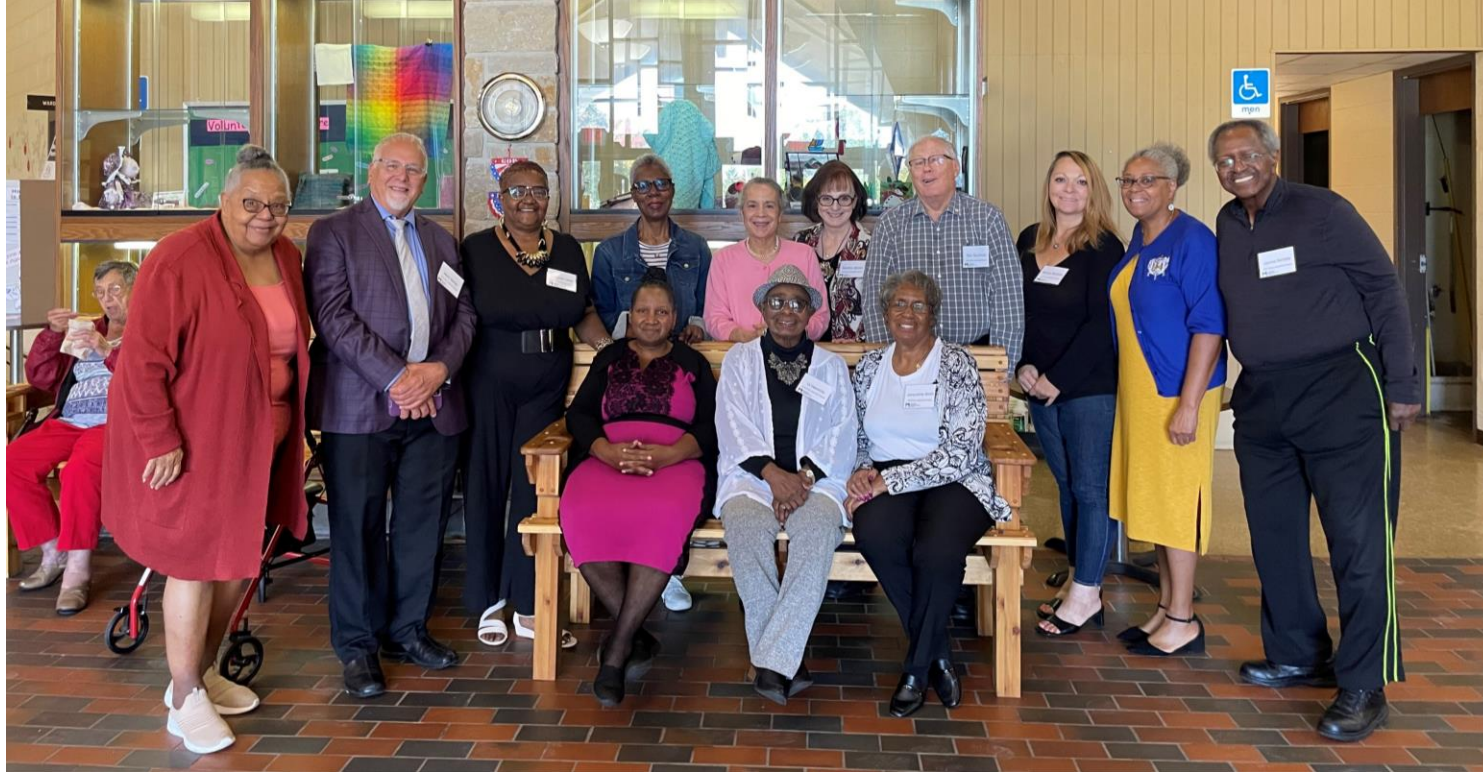
2023 Senior Leadership Group