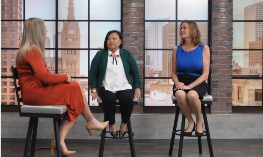
Senior Dining Piece on Fox 6 Wake Up