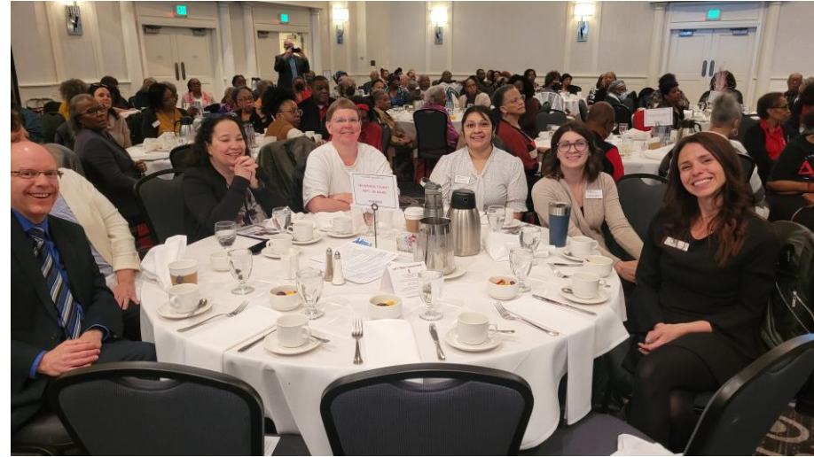
WAI's Breaking the Silence Event