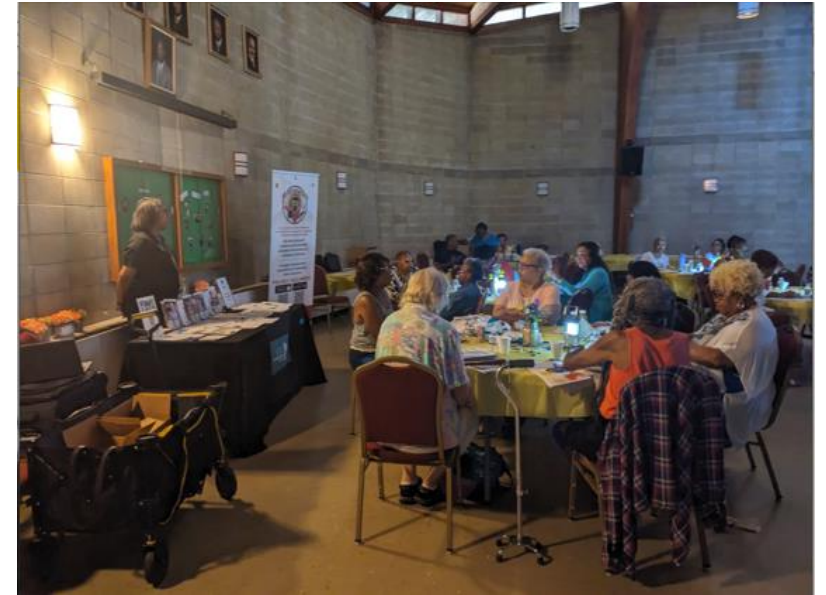
Coffee & Conversation series hosted in partnership with Wisconsin Alzheimer's Institute Regional Milwaukee Office