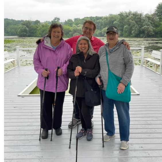
OATS Tour of Wehr Nature Center