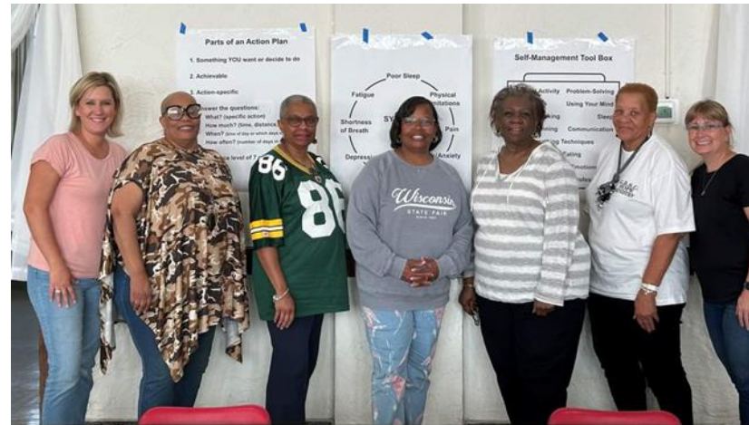
Facilitator Training for HOPE Ambassadors