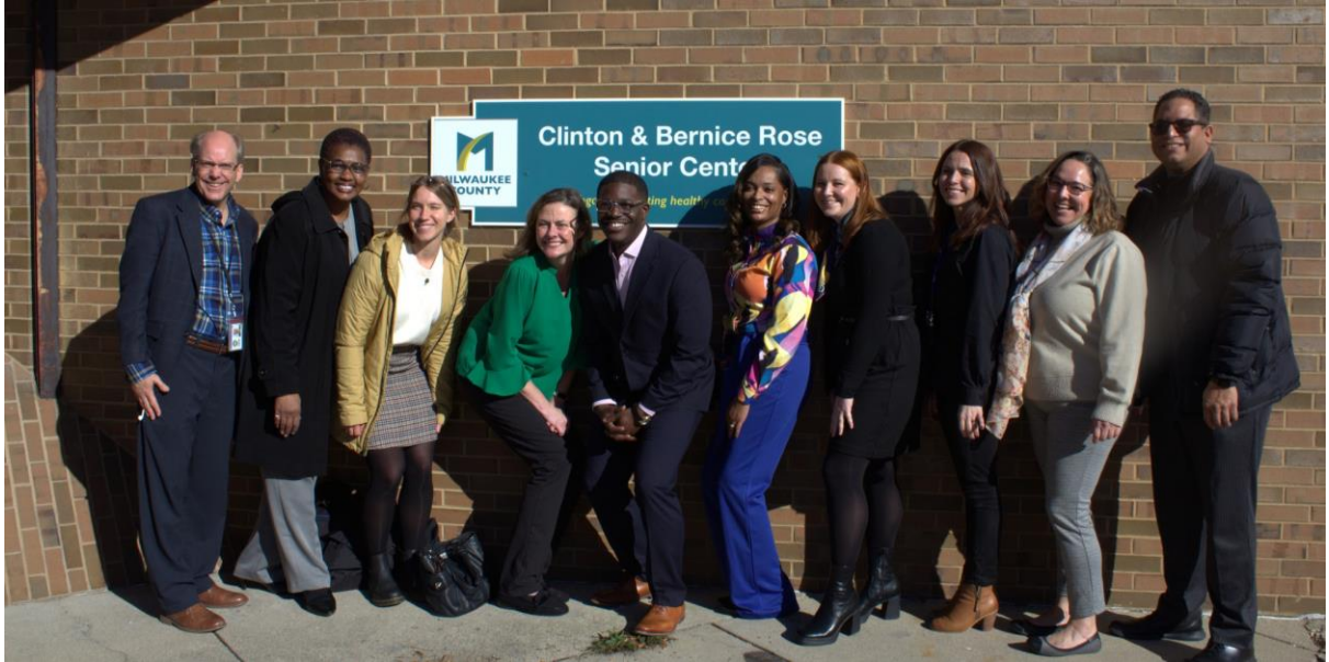
Senior Center Sign Unveiling