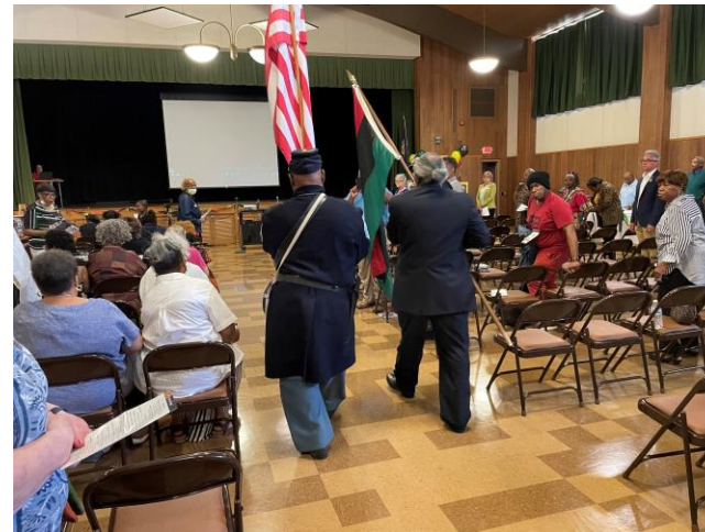
Black History Month Celebration at Washington Park Senior Center