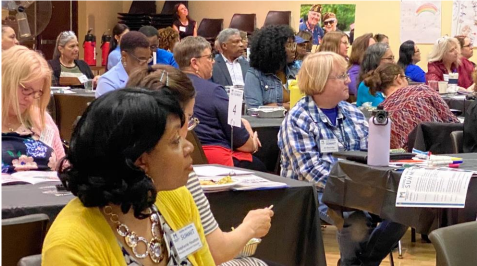
Milwaukee County Aging Network Summit