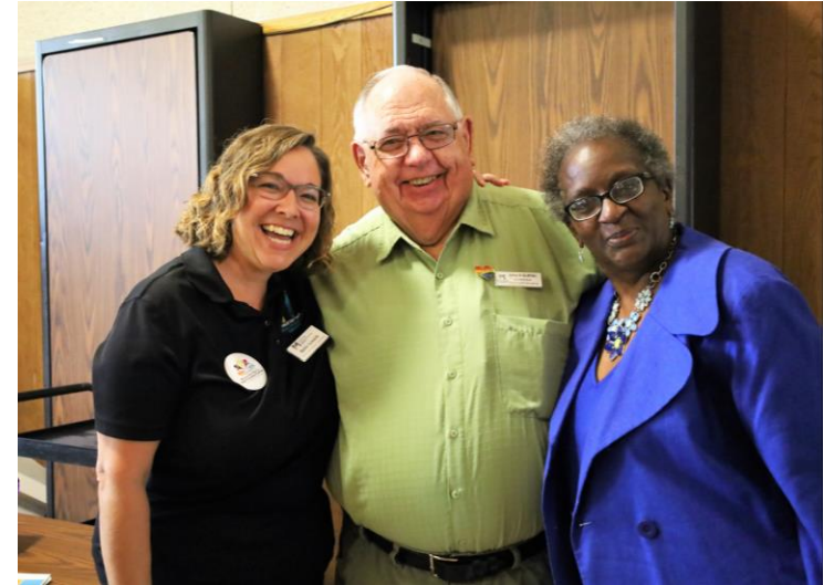
Free From Falls Resource Fair at Washington Park Senior Center