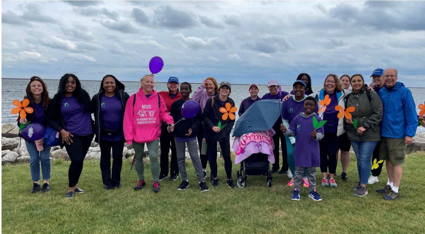
Walk to End Alzheimer's