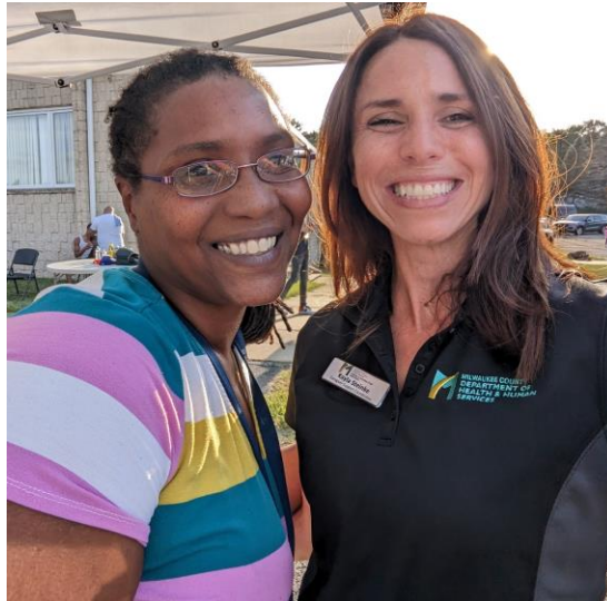
Caregiver Outreach at National Night Out Event