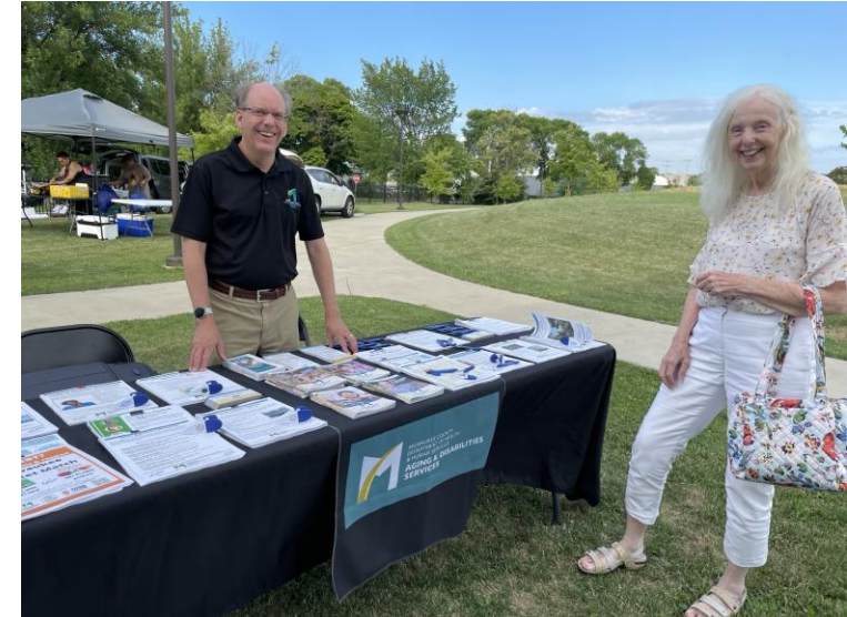
Outreach at Indaba Nights