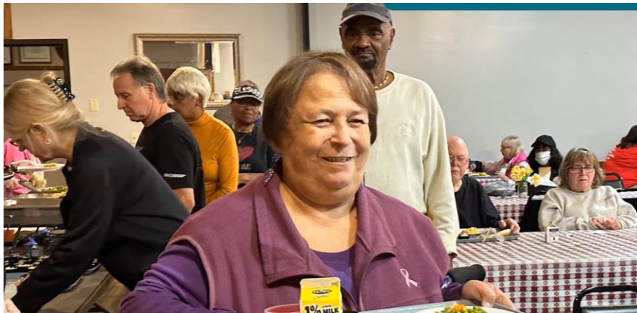
Dine at 5 at Elks Lodge