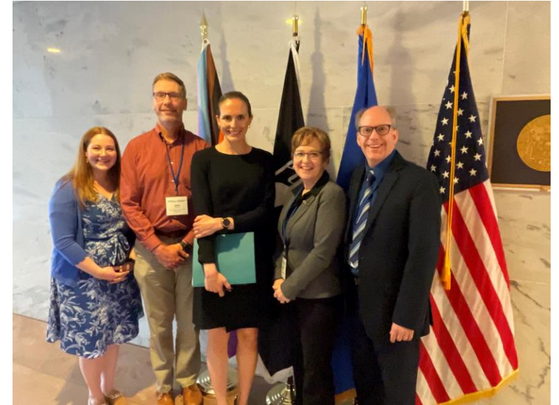
USAging Washington DC Policy Briefing