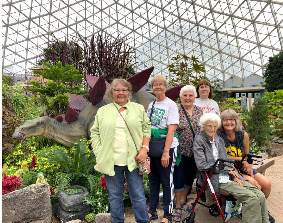
OATS Tour of the Mitchell Park Domes