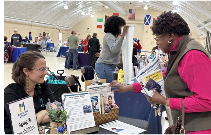
Community Outreach on Transportation