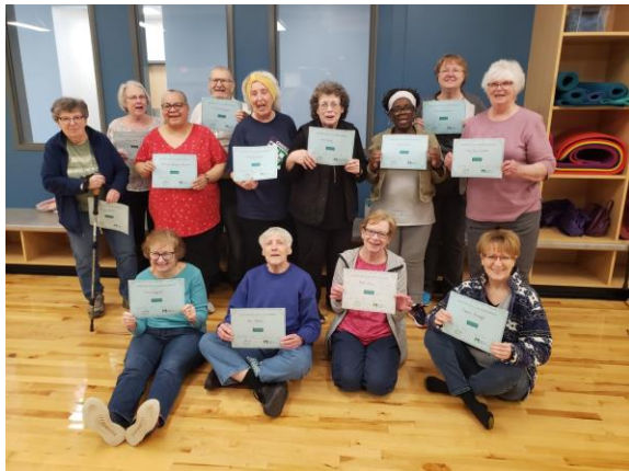
Walk With Ease Graduates