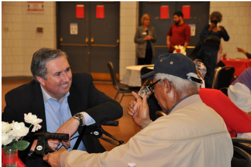
U.S. DHHS Region V Director's Visit