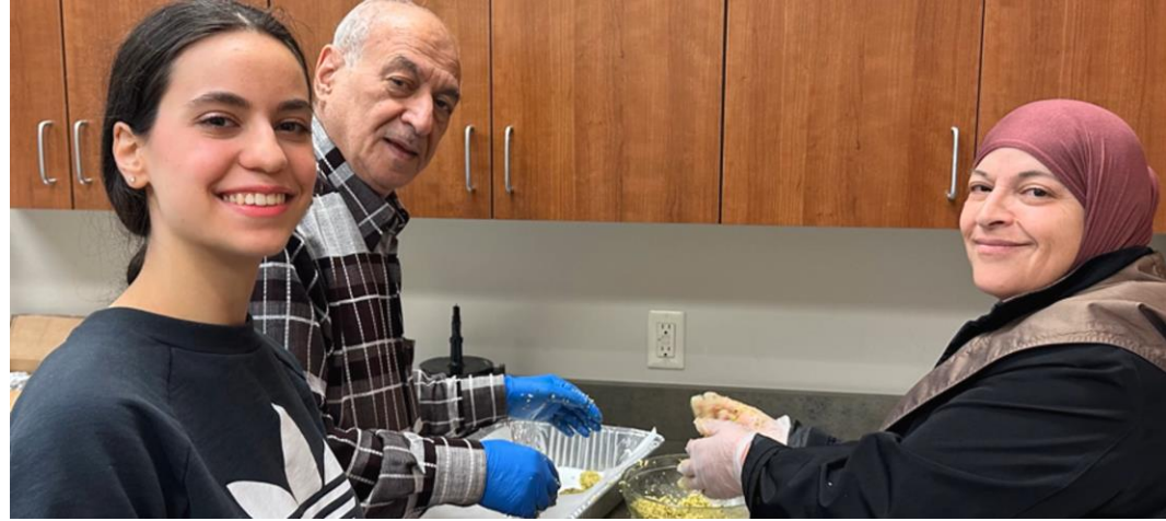
Healthy Cooking Demo