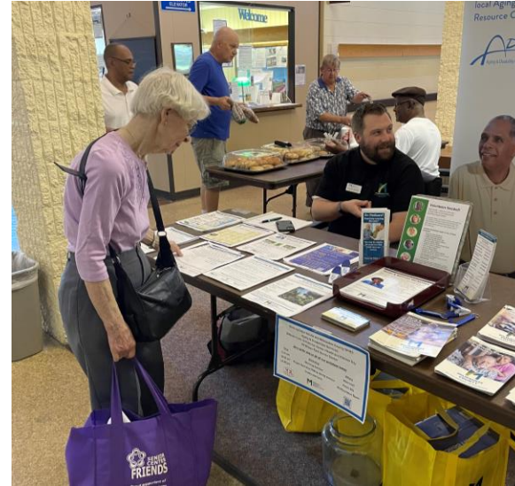
National Senior Health & Fitness Day at Wilson Park Senior Center