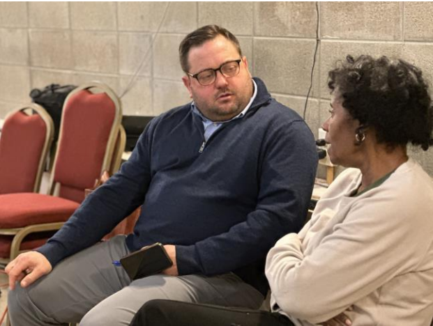
Coffee and a Chat Event