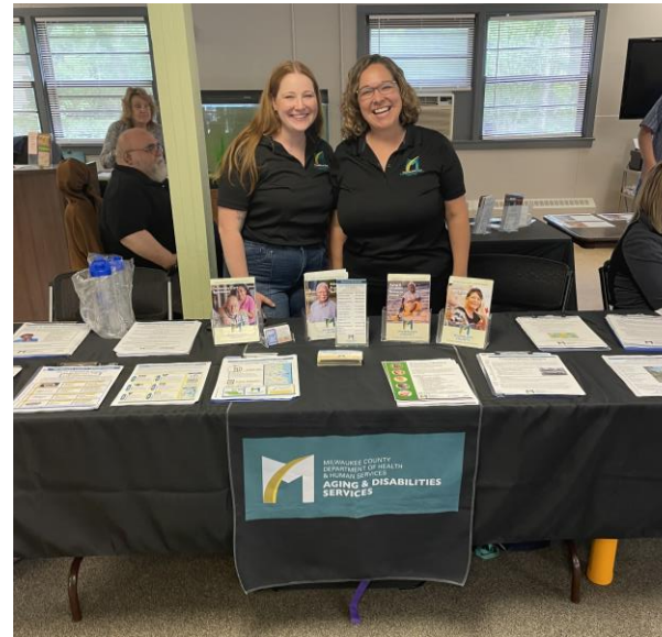
World Elder Abuse Awareness Day