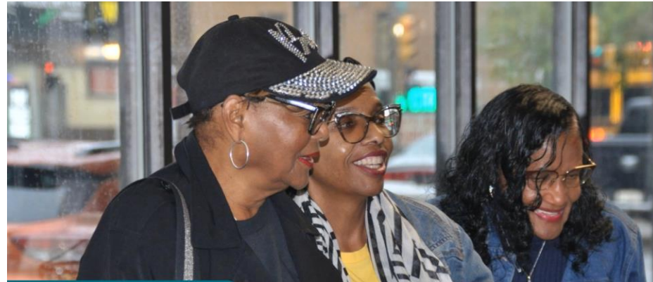
Debut of Rise and Grind Dining Site