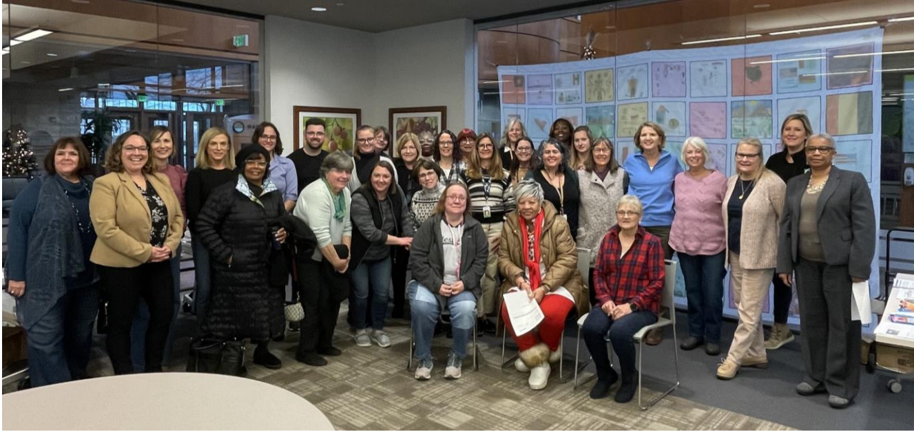
Milwaukee County EBPP Facilitators Meeting