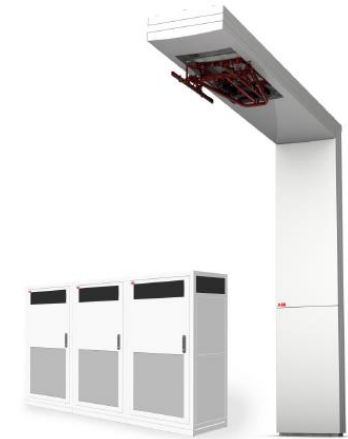
Watertown Plank Driver Facility & Charging Station