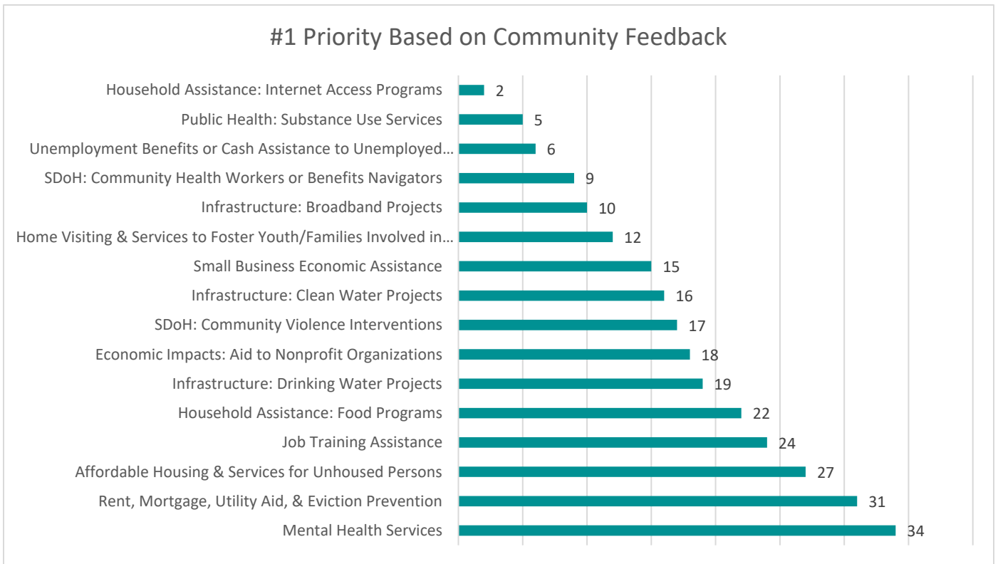
Table C: Milwaukee County ARPA Community Engagement Feedback

The following table demonstratives the community priorities submitted through the Milwaukee County public webpage.