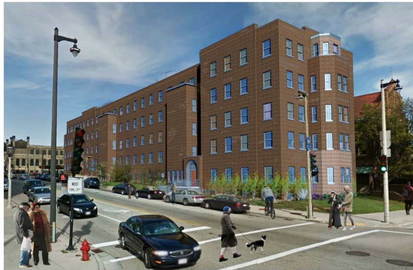
Figure 3: Redeveloped permanent supportive housing facility