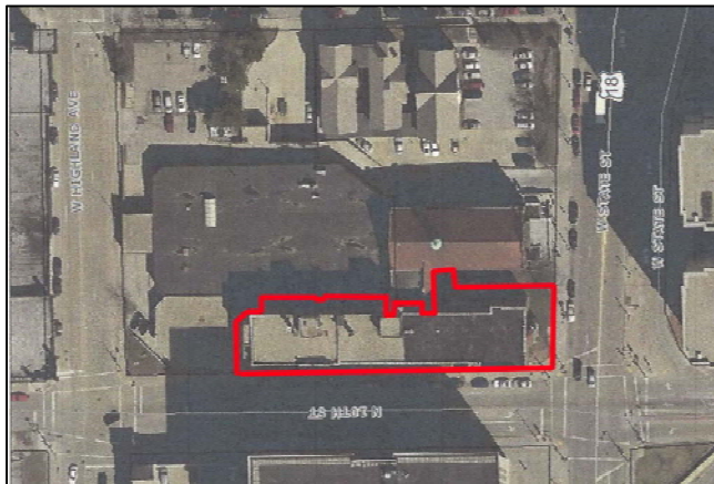
Figure 1: CCC Building Site

The CCC, currently under construction includes a formerly vacant and secured 5-story structure that is physically connected to the Medical Examiner's facility.