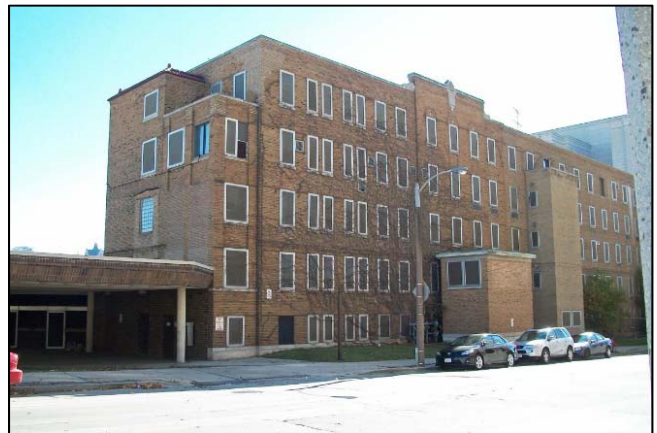
Figure 2: Building from N 10 th St