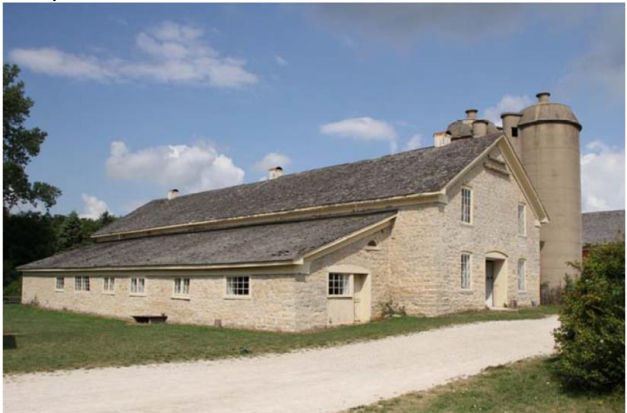
Recent photo of stone barn at Trimborn