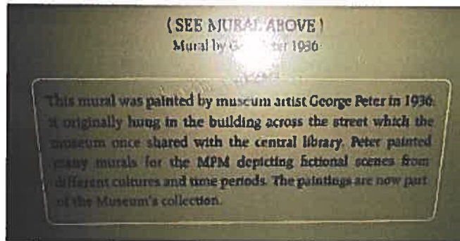
Top: the Museum's wall text crediting C.R. Porteus with the foreground and background of 55 miniature dioramas, 1924–1942. Bottom: the Museum's wall text for a 1936 George Peter mural, stating his paintings are now part of the Museum's collection.