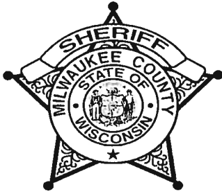
David A. Clarke, Jr. Sheriff