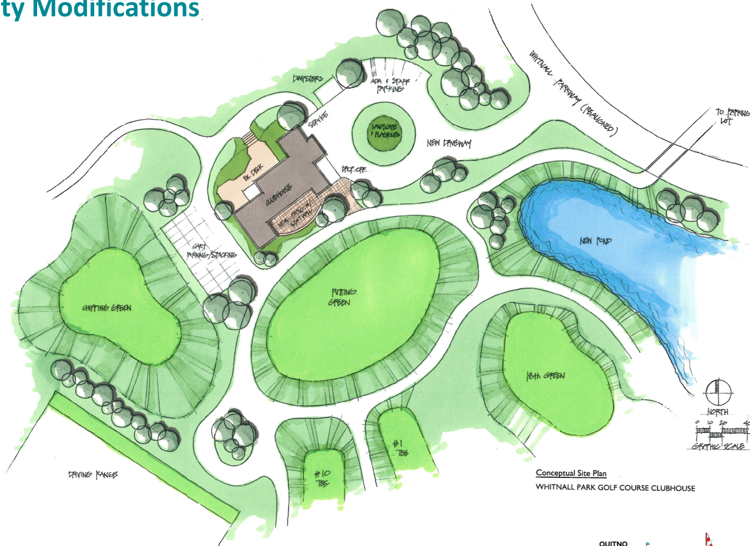
Conceptual Site Plan WHITNALL PARK GOLF COURSE CLUBHOUSE