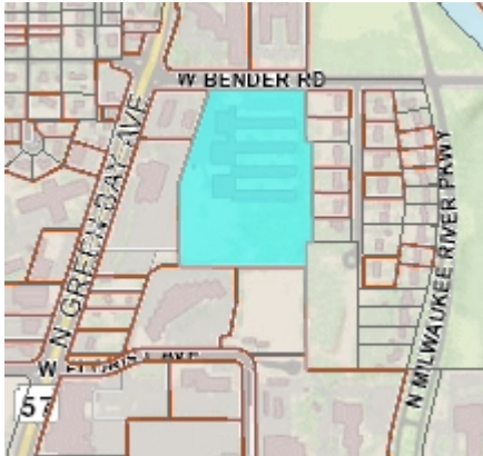
Parcel location within Milwaukee County