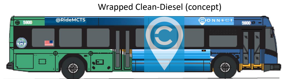
Wrapped Clean-Diesel (concept)