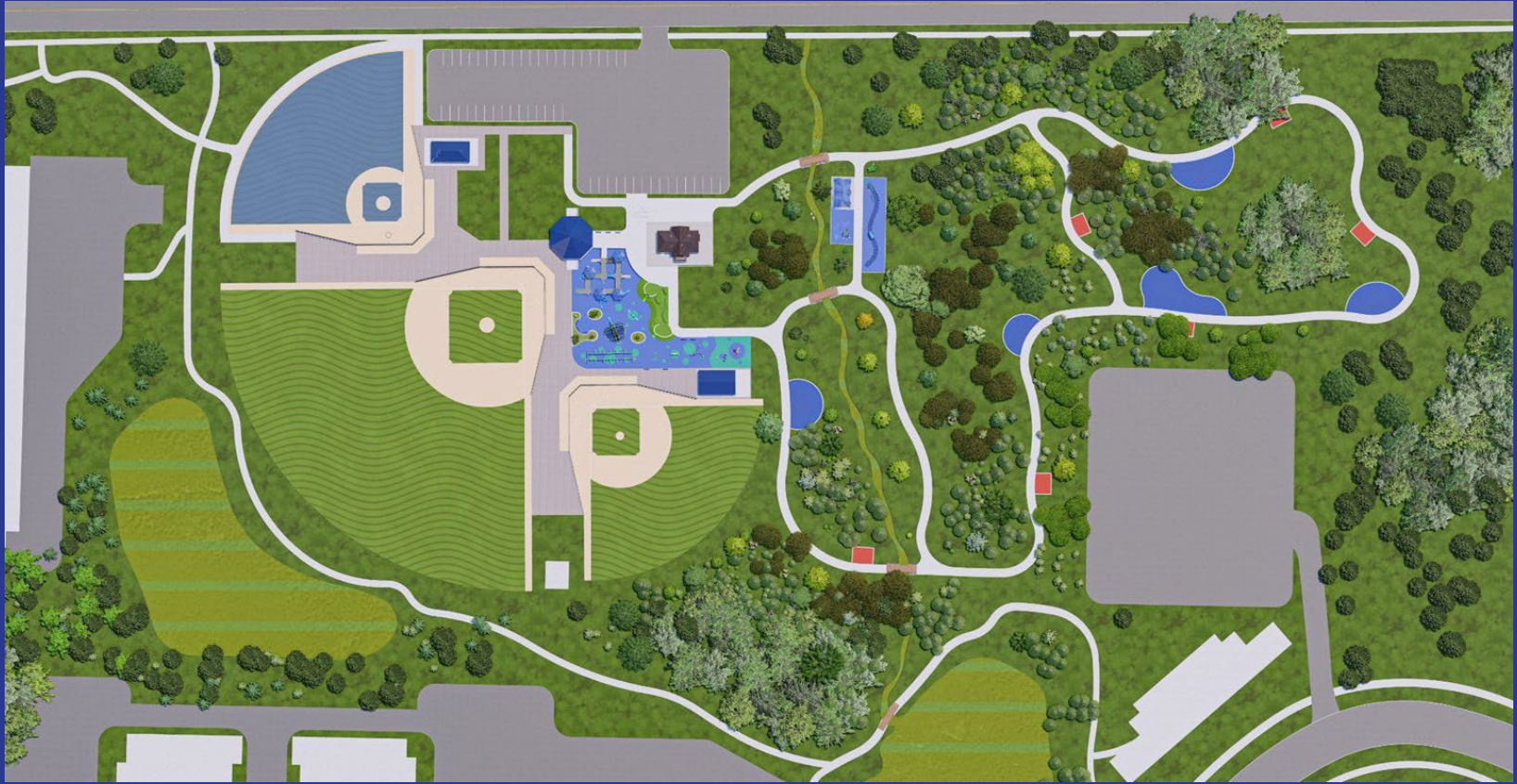
Universal Park Layout Overview