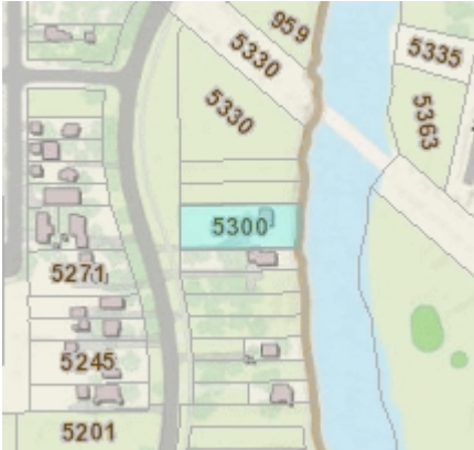
Parcel location within Milwaukee County