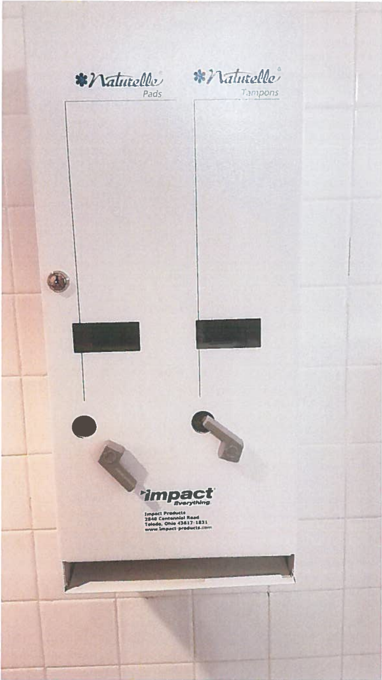
Photo of installed product dispenser