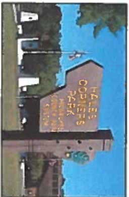
Hales Corners Park