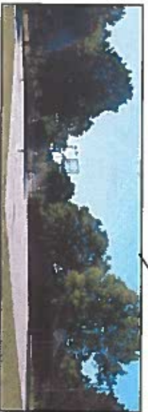
Tennis and Basketball Courts