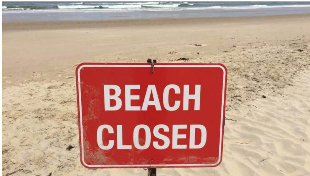
Nobody wants this

In 1994, MMSD implemented the Deep Tunnel project here in Milwaukee, which helps, but doesn't eliminate overflows completely.