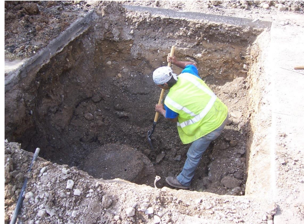
Digging up buried Manhole at Parks