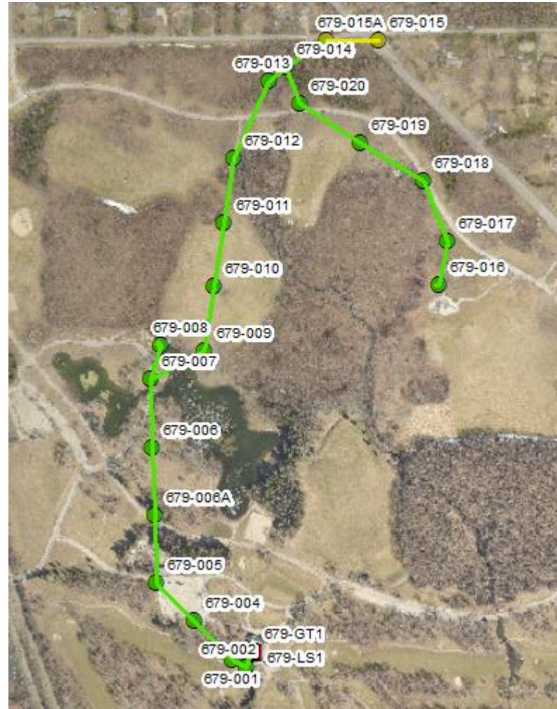
Sewers mapped in GIS at Brown Deer Park