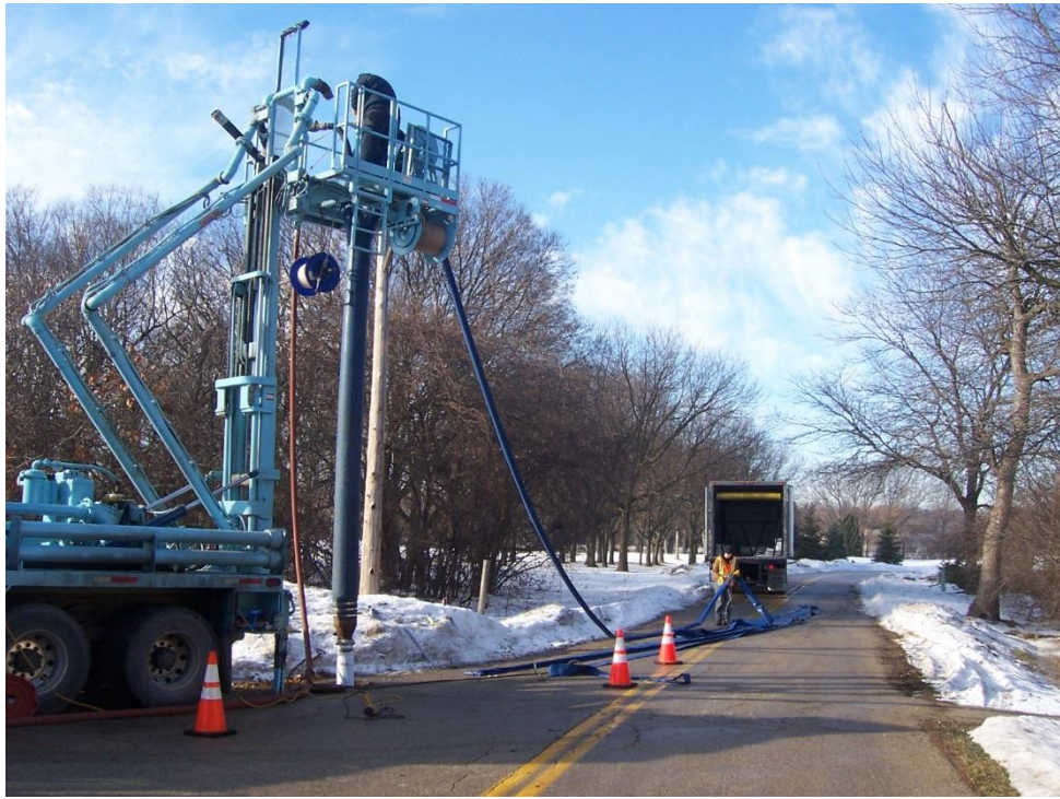
Installing CIPP pipe Liner in Brown Deer Park

Defects are identified through department feedback & annual manhole inspections. Also by pipe dye-testing, smoking, and televising.