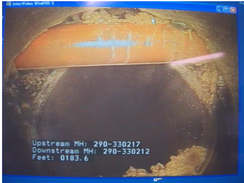
GMIA pipe broken inadvertently by directional drilling & found by televising pipe.