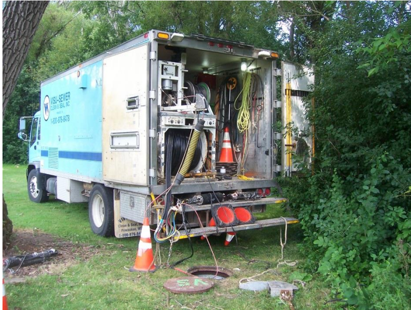
Pipe televising truck